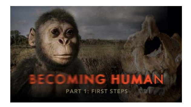
(180 min., 2010, UM DULUTH Library Multimedia GN282 .B436 2010 DVD)

This week we're going to have our first look at Becoming Human —NOVA's three-part series on Prehistoric Cultures. This week we take the "First Steps." We'll take the second step next week with "Birth of Humanity," and the third step Week 11 when we look at "Last Man Standing."